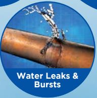
Water Leaks & Bursts

5% OFF BATHROOM PACKAGE MAXIMUM $1,000 CANNOT BE COMBINED WITH ANY OTHER OFFERS