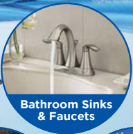
Bathroom Sinks & Faucets