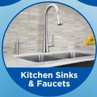
Kitchen Sinks & Faucets