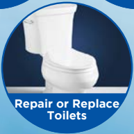
Repair or Replace Toilets