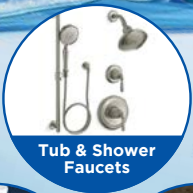
Tub & Shower Faucets