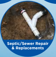
Septic/Sewer Repair & Replacements